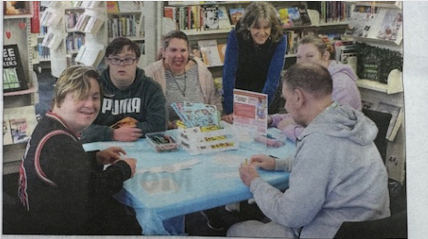
▲ A group from Greenways Trust are welcome visitors to Dargaville's library every Thursday. This week they took part in a programme that ran through the school holidays under the banner of Love your Library. As well as fun activities and book bags to decorate and take home, feedback from the public confirmed that local library services are greatly appreciated.

The library has become an integral part of the Greenways day program. With regular visits, our people eagerly look forward to crossing the road for some quality reading time.